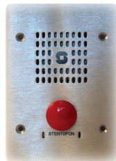
Vandal Resistant IP Substation (3 Gang)