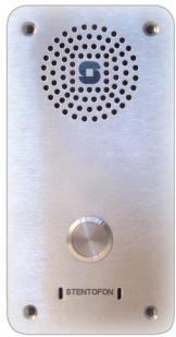
Vandal Resistant IP Substation

The information in this document pertains to the following STENTOFON IP Substations: